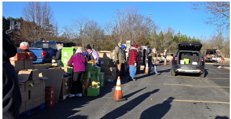
People picking up their shares.