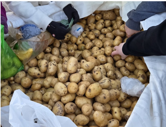
1200 #'s of potatoes

Order your Easter flowers now. Look for the envelopes—available at church or from Cheri Gibeaut. To place your order fill out the information on the Easter Flower envelope and include a check made out to your church and turn the envelope and check into Cheri. If you have questions, you can reach Cheri at 608-697-0393 or cgibeaut13@yahoo.com. Due April 6.