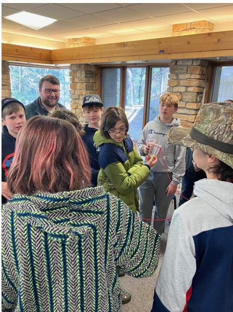
Conference Confirmaton Retreat