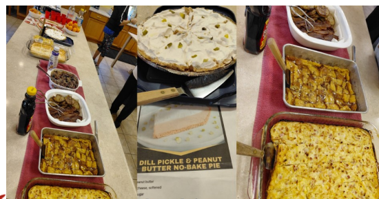
Church Chixs August