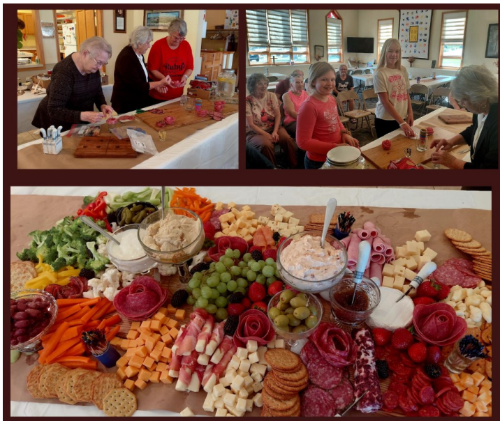
We had 17 attend the Charcuterie class. We learned a lot of great tips for making beautiful charcuterie boards. It was fun and very delicious!